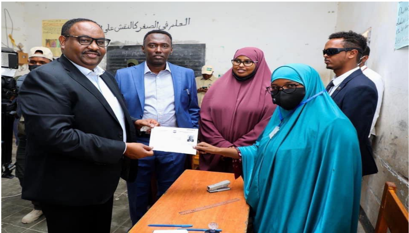
Said Deni, Puntland President, registers in Qardo district for the 2021 LGE

The Puntland Parliament, for its part, initiated a debate in June 2019 on changing the system of elections in Puntland. A parliamentary committee was appointed to determine how Puntland could transition from the current electoral process. At the following session, the government nominated five members for the electoral commission, and four members were nominated by the Parliament. The nine-member TPEC was finally approved by the Puntland parliament on 16 November, 2019. 6