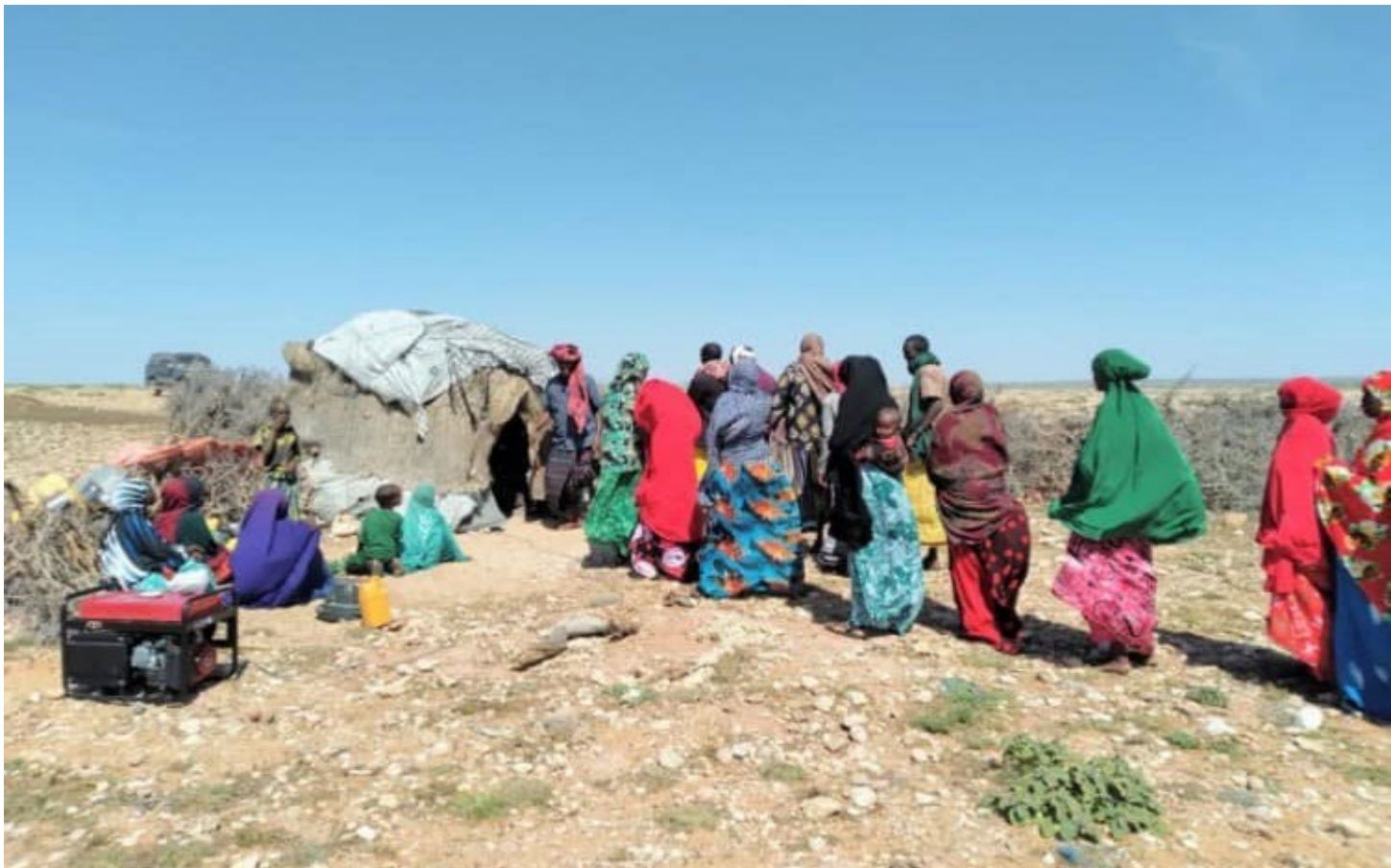
Voter registration by TPEC mobile teams in a rural area under Eyl district

Puntland women have been visibly part of the democratization process of Puntland and in the three districts where ELGE will be held, Puntland Women have registered at a higher rate (50.5%) than men (49.5%). Women approximately constitute at least 50% of the population but have been consistently underrepresented in political systems. However, systemic challenges, financial limitations, and societal stereotypes against female participation politics continue to hamper their engagement and representation in politics including assuming leadership roles in political associations and getting elected into elective posts.