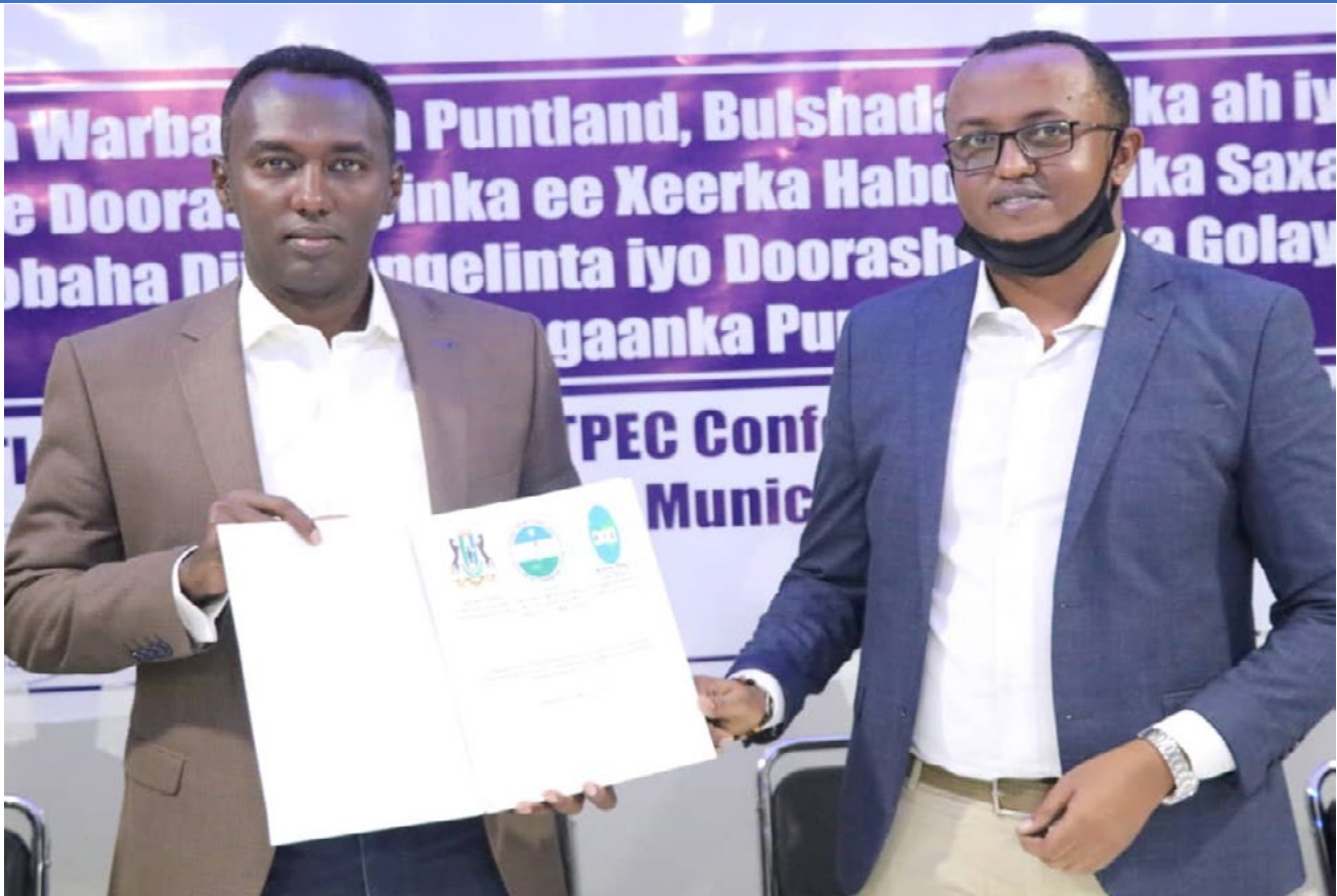
TPEC and MAP Chairpersons signing the Puntland Journalists Code of Conduct for Local Elections awareness campaign

The role of PUNSAA in the electoral process revolves around three aspects: observing the work of TPEC, conducting grassroots awareness raising on the importance of registration and elections, and organizing forums and platforms for direct conversation and Q&A between the public and the TPEC. PUNSAA trains and inducts agents of political association in the democratization process, voter registration, roles and responsibilities, and other crucial aspects of the electoral process. For instance, at the launching of voter registration in Qardho district, PUNSAA with support from the European Union trained observers and agents from political associations. 12